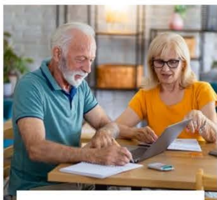
Financial Abuse →